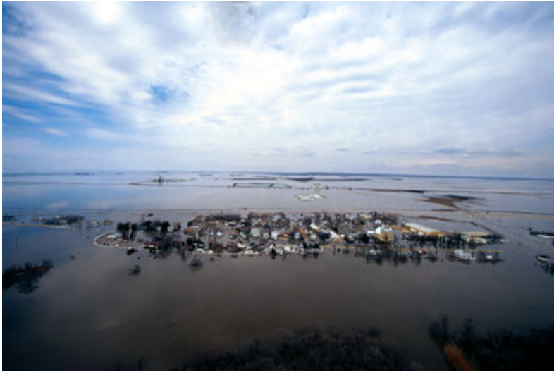
(above) The Red River in southern Manitoba floods regularly. A massive flood extending from mid-April to early May 1997 flooded 1950 km 2 of land and resulted in the evacuation of 30 000 Manitobans. Some 8600 troops were mobilized to assist civil authorities.