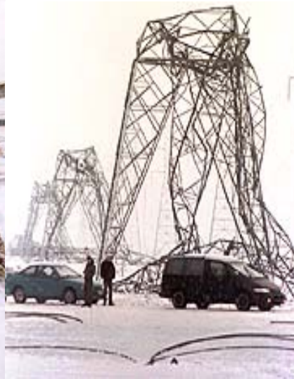
(above) The Ontario-Québec ice storm of January 1998 caused the deaths of 25 persons through hypothermia, asphyxiation and fires induced by overheated stoves.