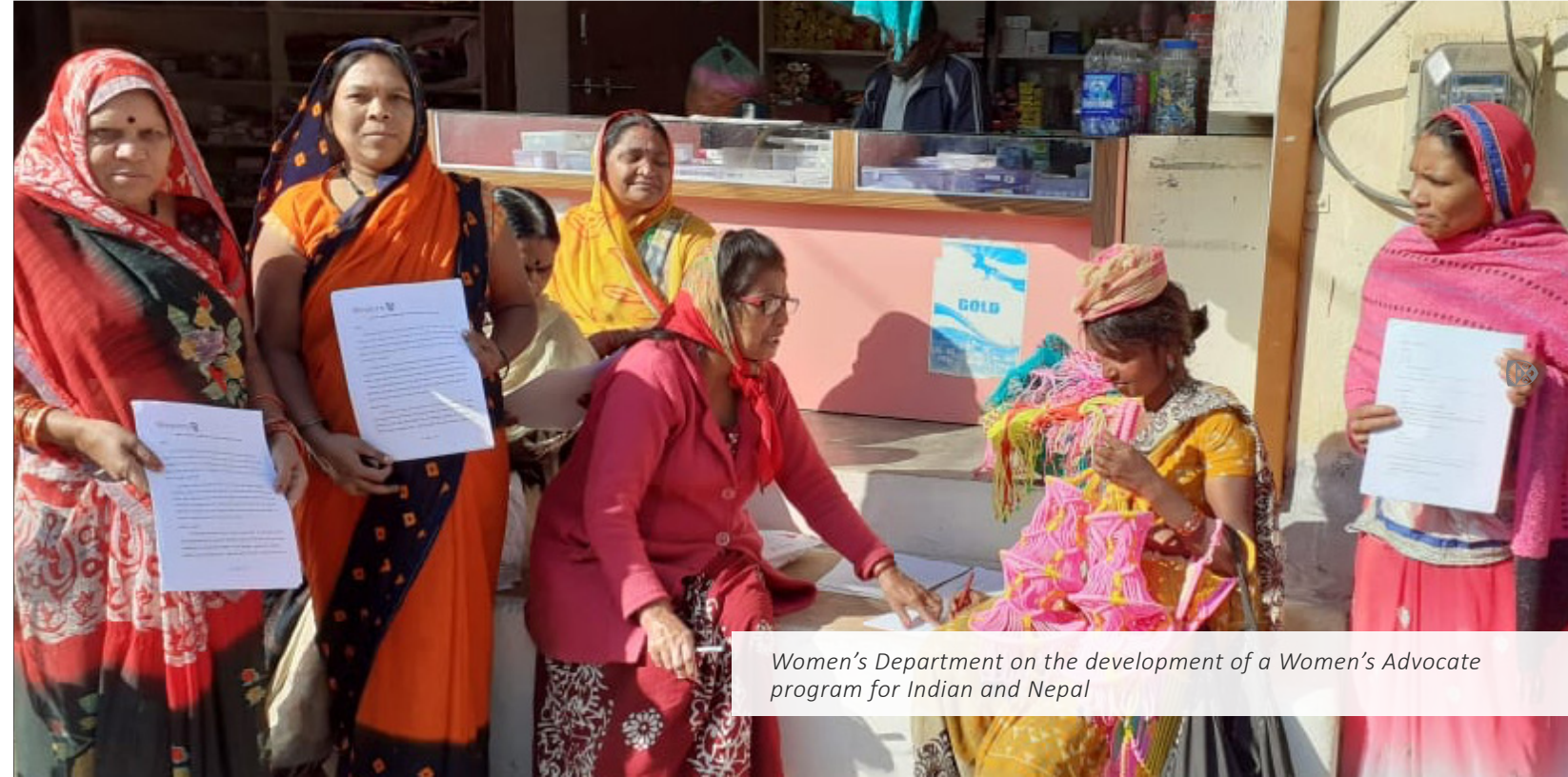
Women's Department on the development of a Women's Advocate program for Indian and Nepal