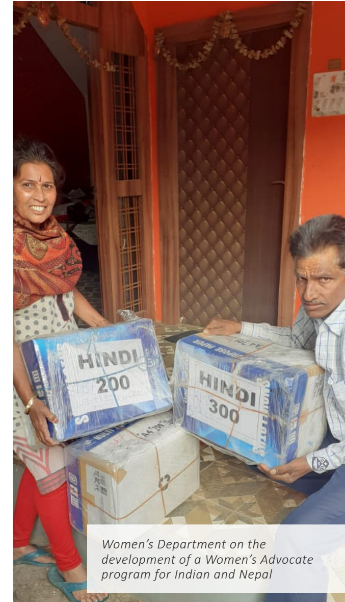
Women's Department on the development of a Women's Advocate program for Indian and Nepal

Rio Tinto is an Anglo-Australian multinational company and one of the world's largest metals and mining corporations. The Centre has been contracted to develop and deliver in-person and online training in French and English to address domestic violence in the workplace for sites in North America.